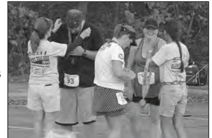
Run volunteers present medals to finishers.