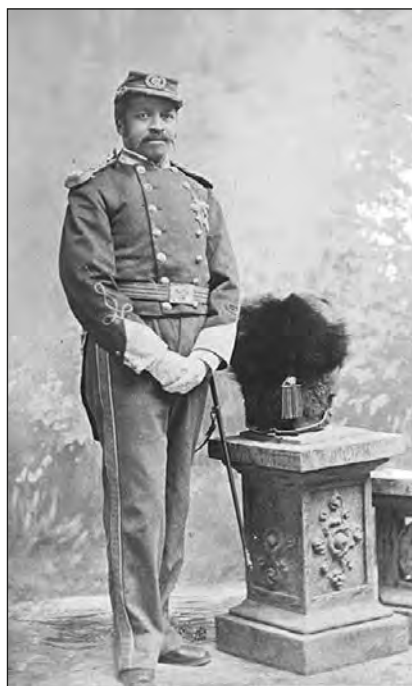
Sgt. Major Christain Fleetwood received the Medal of Honor for having "Saved the regimental colors after eleven of the twelve color guards had been shot down around it." Sgt. Major was the top rank allowed to a colored soldier at that time.

By the close of the Civil War 166 regiments of African-American troops had been raised for the Union: 145 regiments of infantry, 7 of cavalry, 12 of heavy artillery, and one of engineers. They served with honor on countless battlefields and sacrificed 2,751 lives to set their brothers free.