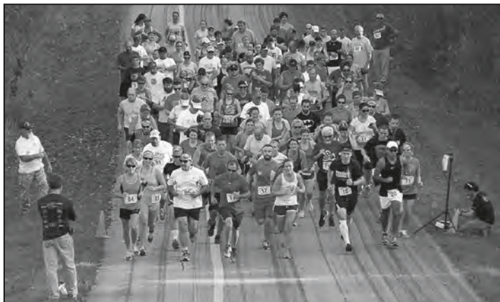
The start of the 2014 Bloody Hill Run

Each year more than 175,000 people visit Wilson's Creek National Battlefield, one of only six National Park Service sites in Missouri. Visitors come from all over the United States and many foreign countries to discover both its historic significance and its natural beauty. However, even though it is located only a few miles south of Springfield, many area residents have never visited the park and are not aware of all it has to offer. In an effort to bring new visitors to the park and promote its facilities, the Wilson's Creek Foundation sponsored our second annual Bloody Hill Run on October 25, 2014, a USATF certified 8K run and a 1-mile fun run.