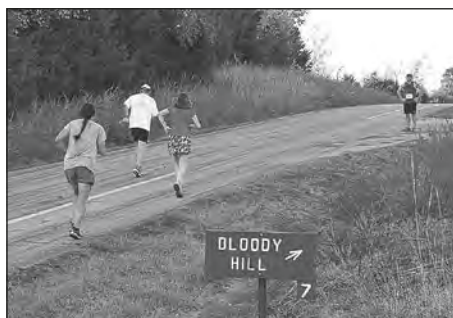
The toughest part of the run, the climb up Bloody Hill

Each 8k runner received a barbecue dinner, long-