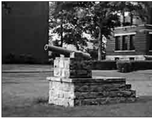
Drury cannon north

Drury. These three are "sister" cannons, all having been manufactured at the same arsenal and in the same lot. They are "captured" or "surrendered" (later called "memorial") Confederate States of America guns from the Augusta, Georgia Arsenal, 1863. They were from a lot of about 60 guns, all twelve-pounders in the Napoleon style made of brass or bronze. They were originally sent to the CSA Army of Tennessee in the summer of 1863.