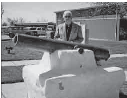
Walnut Grove cannon

Today, there are only three of the eight cannons accounted for. One is located at Walnut Grove High School in Walnut Grove, MO. The other two are on the campus of Drury University in