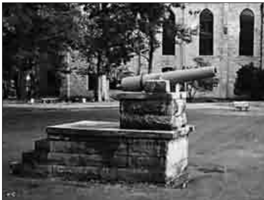
Drury cannon south