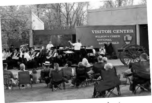
College of the Ozarks Orchestra

Arts in the Park is sponsored by Wilson's Creek National Battlefield Foundation and Eastern National.