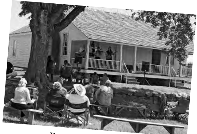
Ray House Jamboree