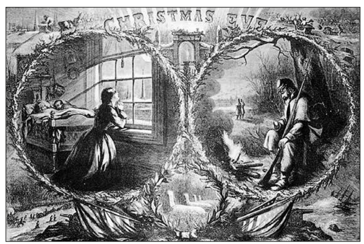
A Thomas Nast illustration of a couple separated by war on Christmas Eve, from Harpers Weekly, January 1863

Gettysburg address, the main speaker, an orator from Massachusetts, spoke for nearly two hours.